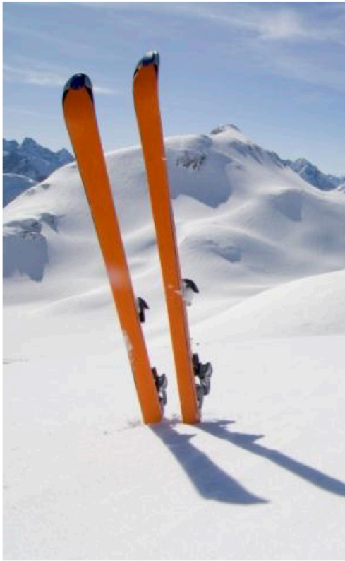
Black Ski Inc,